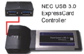
*Shown bundled w/ ExpressCard